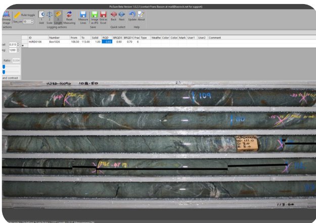
Photo logging of core

While we always recommend geotechnical logging of the whole core at the time of drilling, we can undertake photo logging of the historical core, for surface and underground diamond holes that were not previously logged.